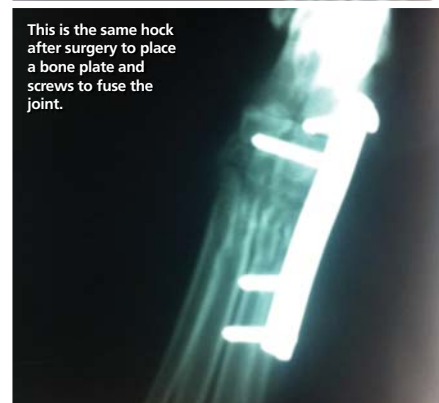
This is the same hock after surgery to place a bone plate and screws to fuse the joint.

If you and your dog are faced with injury, decisions are not always easy, we are always here to provide information on options and support the decision making process.