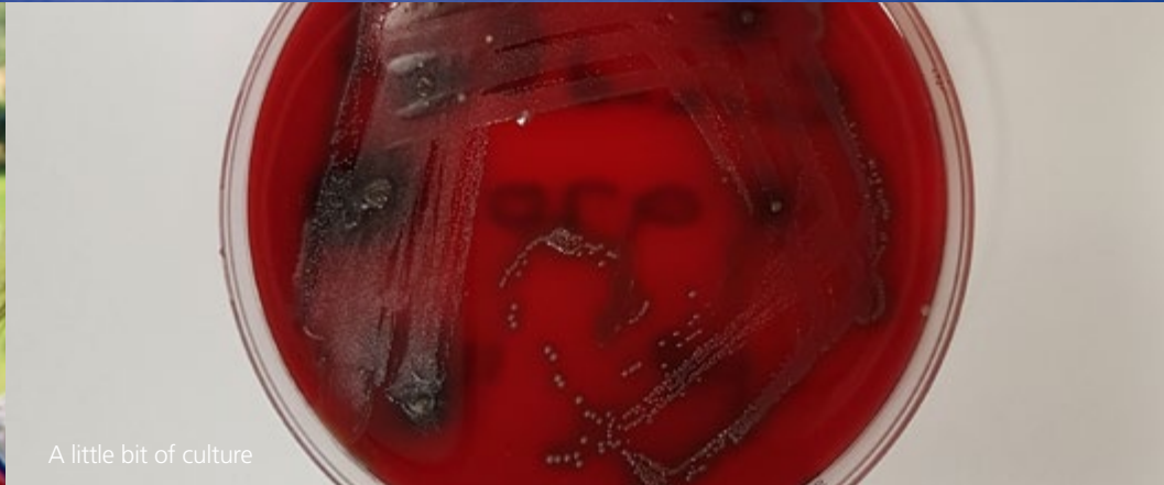
A little bit of culture